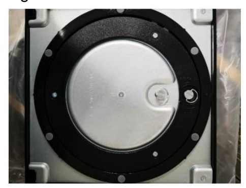
Push button and lift the stand body and remove the screw(4EA)