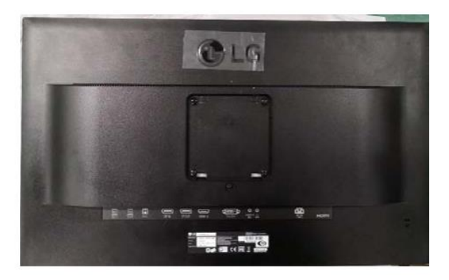
Re-overturn the set and disaaemble screw 4EA and disassemble the PCB